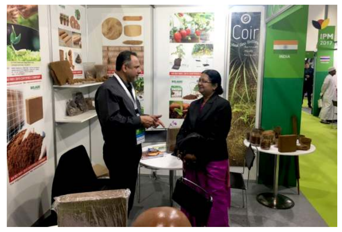
those exporters who have participated the fair along with the Coir Board. The information furnished by the participant exporters are summarised under;